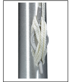
Heavy Duty Cleat