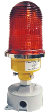
Shown with optional Low Surface Mount (11.25" overall height)