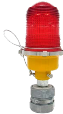
Shown with optional 2" Pole Mount