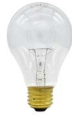
Incandescent Lamp Included