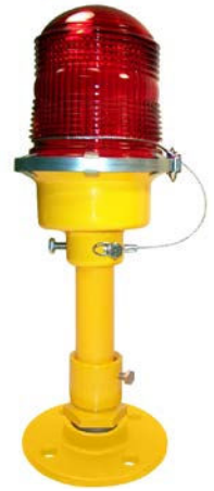
Shown with Riser, Frangible Coupling and Floor Flange (14" overall height)