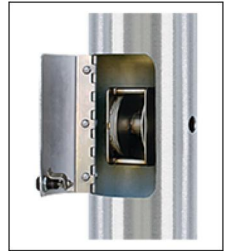
IWW - WINCH Flush Mount Hinged Door

NOTE: Flagpole Components on Anodized and Powder Coat flagpoles (excluding specified Ornaments and Ball Trucks) will match flagpole color specified.