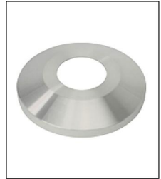
COL1-A10S-ACL FC-11 Spun Alum 1-Piece