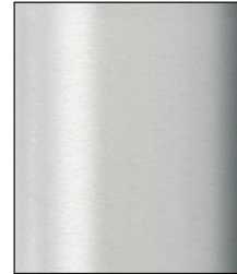
ACL Clear Anodized