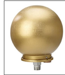
TRK-9816-GDT Ball Truck - 10" Revolving - Gold